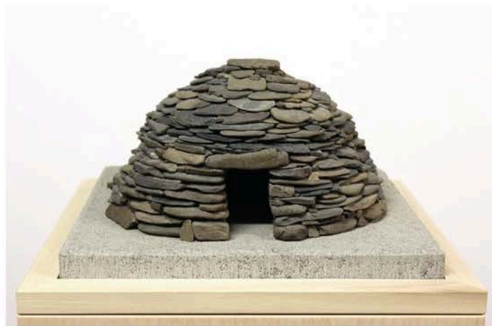
Greg Slick, "Primal Structure # 2"

SUGAR LOAF — Greg Slick's work, at the crossroads of art, archaeology, and anthropology, investigates the influence of ancient and "primitive" cultures on modern and contemporary art.