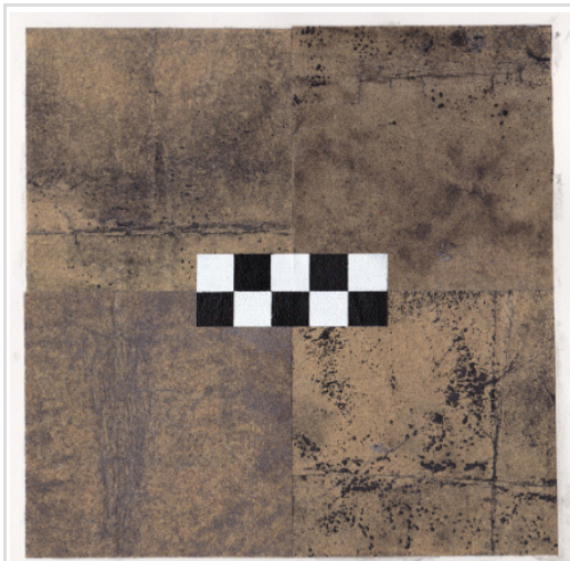
Untitled 10 ("Fieldwork" series), Greg Slick 2016, Acrylic on used sand paper

The Matteawan Gallery in Beacon New York is currently exhibiting the work on paper of 17 diverse artists. Two of the artists, Greg Slick and Eleanor White, use geometric themes while exploring unique textural elements.